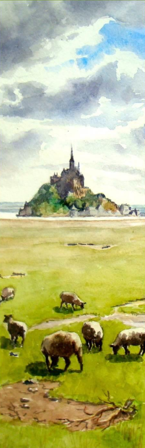
The Mont Saint-Michel (a watercolor by Paul Hervieu).